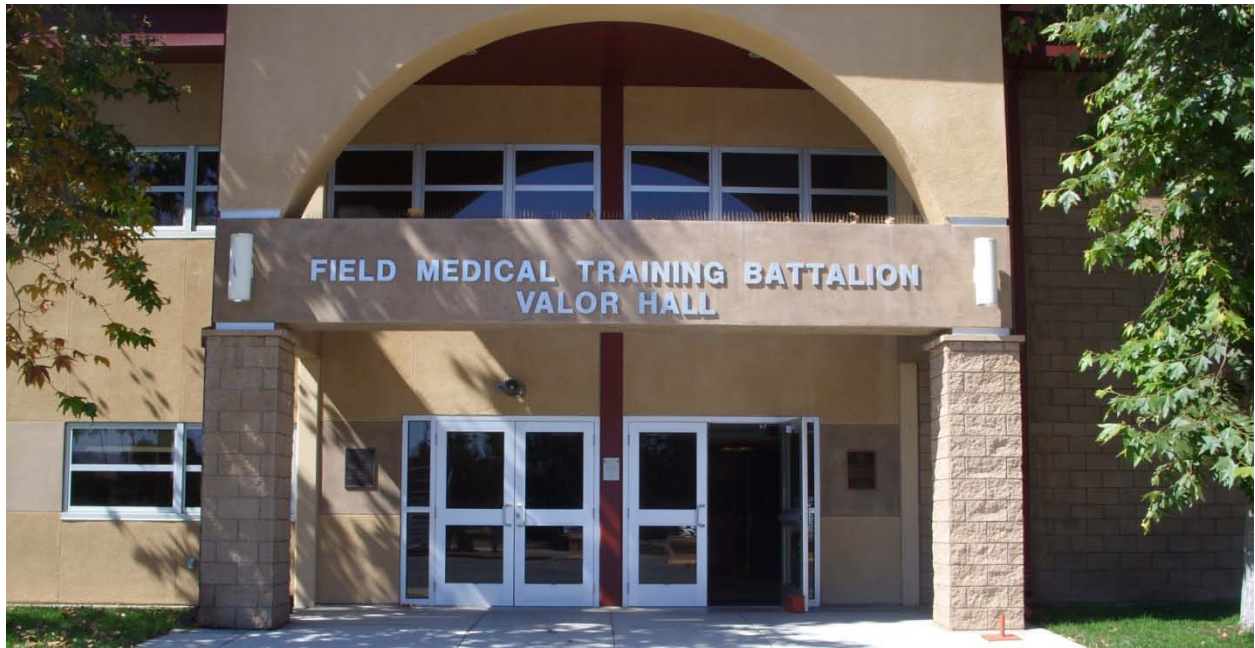
Valor Hall, the Field Medical Training Battalion building where the VTS Military Reintegration Conferences for Marines, Sailors and Soldiers are held.