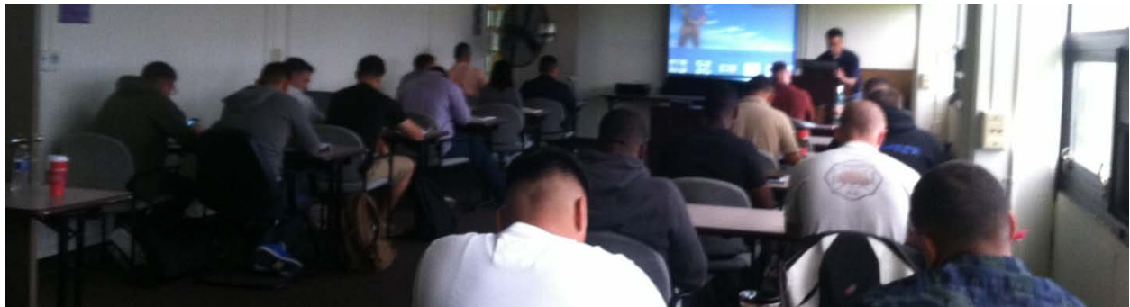
(above) 26 Marines and Sailors attend the VTS Military Reintegration Conference and earn their OSHA 10 Hour Construction Safety Certification at no cost to the service members.

On April 12-13, 2014, Veterans Transition Support (VTS) sponsored the 1st Military Reintegration Program for 26 Marines and Sailors at the 1st Civil Affairs Group Building in Camp Pendleton, CA to transfer military experience into civilian job skills with a "No Cost OSHA 10 Hour Construction Safety Training Course" and provide a venue for veteran business leaders to talk about their industries and network with transitioning military personnel.